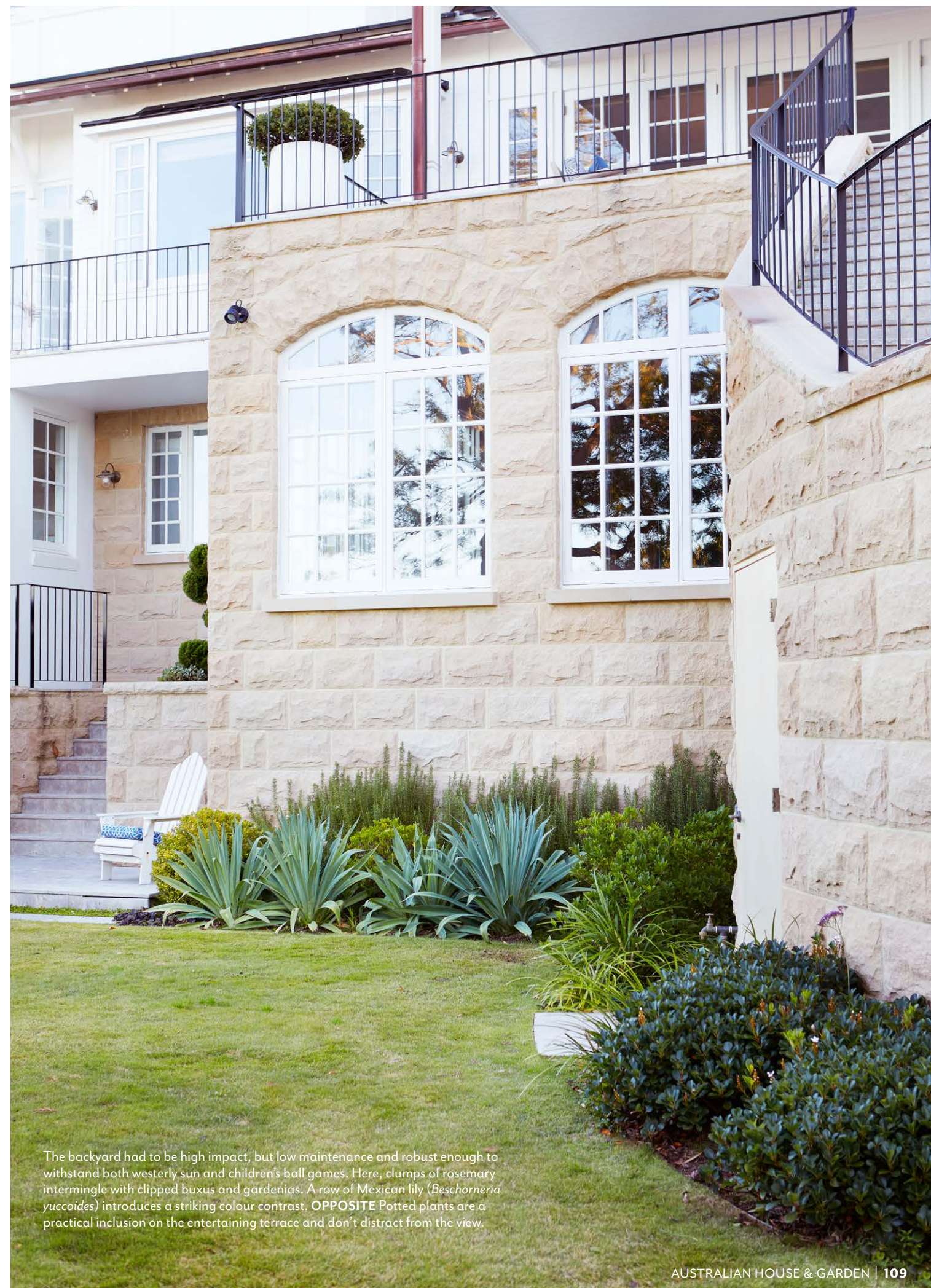
The backyard had to be high impact, but low maintenance and robust enough to withstand both westerly sun and children's ball games. Here, clumps of rosemary intermingle with clipped buxus and gardenias. A row of Mexican lily ( Beschorneria yuccoides ) introduces a striking colour contrast. OPPOSITE Potted plants are a practical inclusion on the entertaining terrace and don't distract from the view.