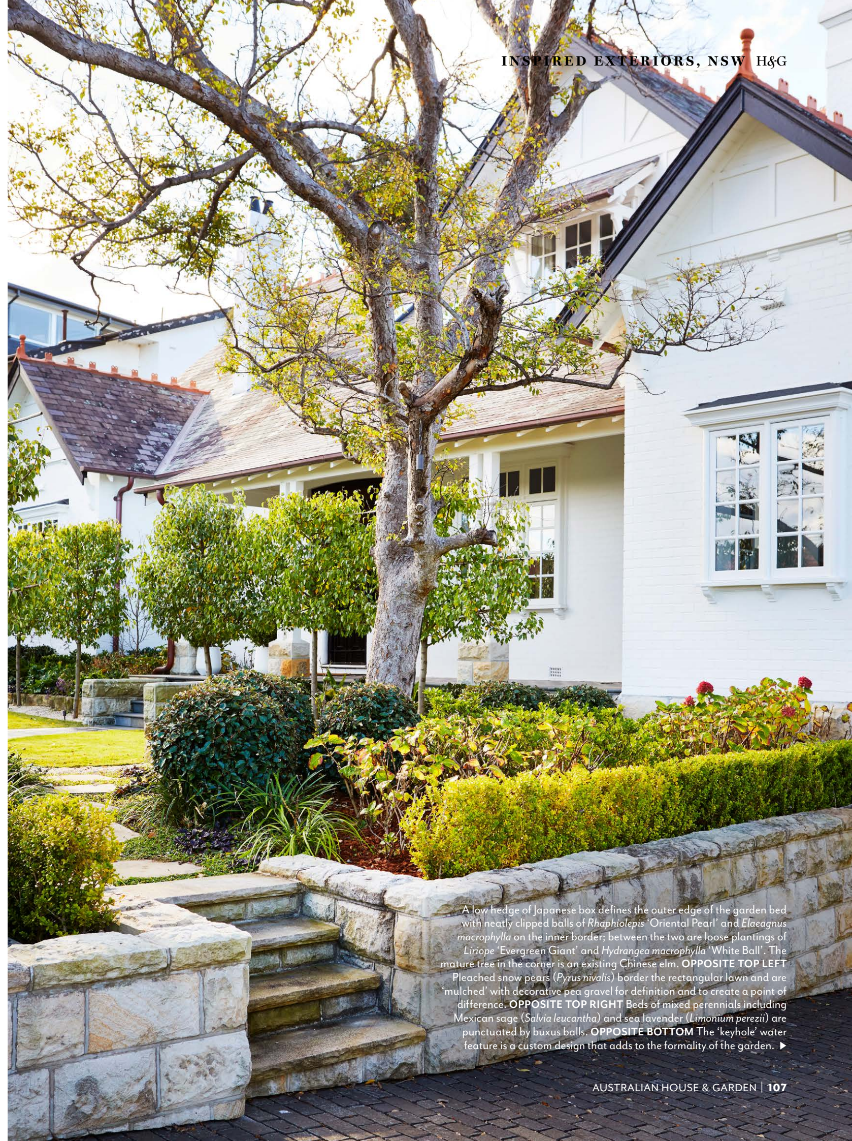
A low hedge of Japanese box defines the outer edge of the garden bed with neatly clipped balls of Rhaphiolepis 'Oriental Pearl' and Elaeagnus macrophylla on the inner border; between the two are loose plantings of Liriope 'Evergreen Giant' and Hydrangea macrophylla 'White Ball'. The mature tree in the corner is an existing Chinese elm. OPPOSITE TOP LEFT Pleached snow pears ( Pyrus nivalis ) border the rectangular lawn and are 'mulched' with decorative pea gravel for definition and to create a point of difference. OPPOSITE TOP RIGHT Beds of mixed perennials including Mexican sage ( Salvia leucantha ) and sea lavender ( Limonium perezii ) are punctuated by buxus balls. OPPOSITE BOTTOM The 'keyhole' water feature is a custom design that adds to the formality of the garden. ▶