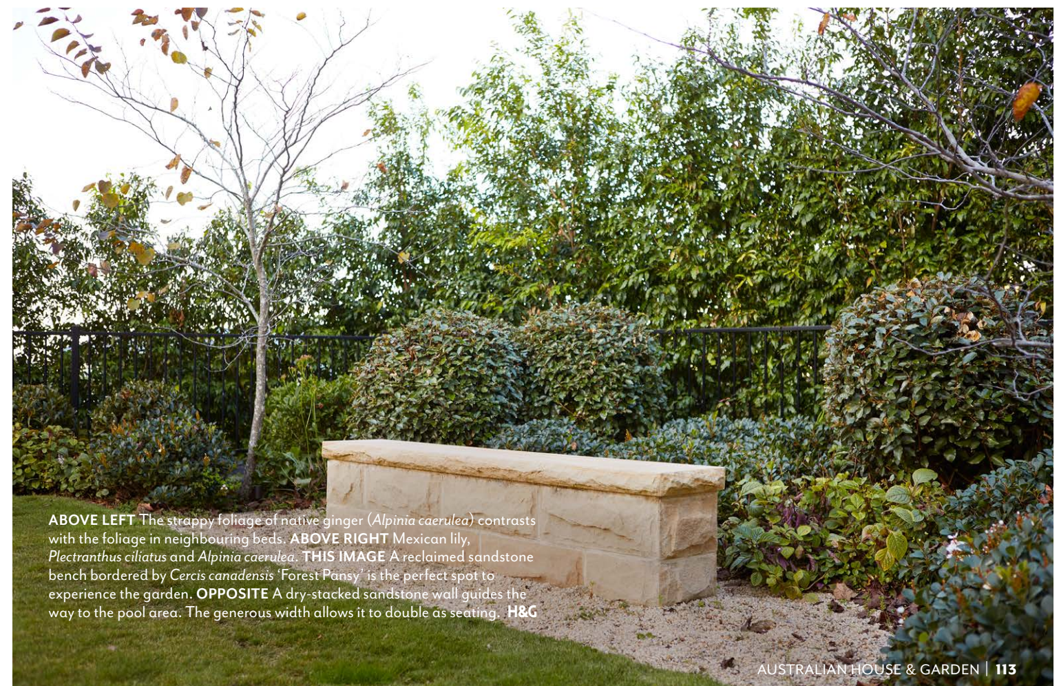
ABOVE LEFT The strappy foliage of native ginger ( Alpinia caerulea ) contrasts with the foliage in neighbouring beds. ABOVE RIGHT Mexican lily, Plectranthus ciliatus and Alpinia caerulea . THIS IMAGE A reclaimed sandstone bench bordered by Cercis canadensis 'Forest Pansy' is the perfect spot to experience the garden. OPPOSITE A dry-stacked sandstone wall guides the way to the pool area. The generous width allows it to double as seating. H&G